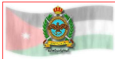
Jordanian General Intelligence Department